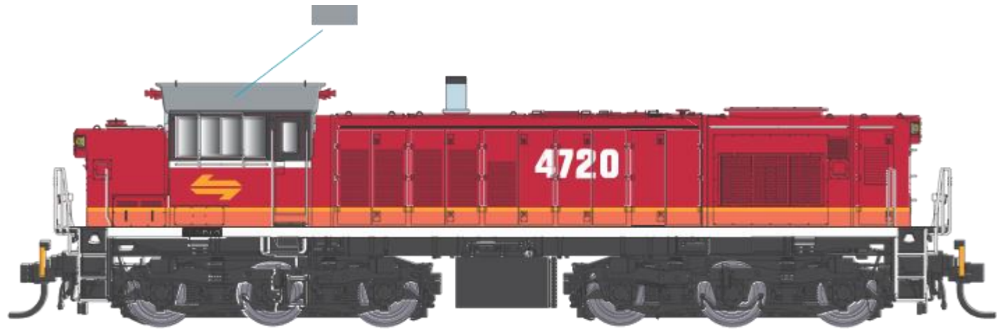
4720 - CANDY