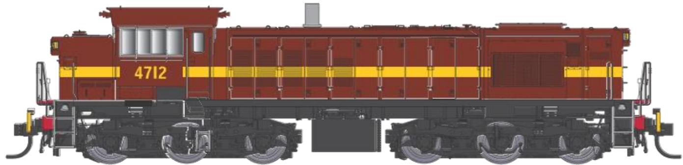
4712 - INDIAN RED