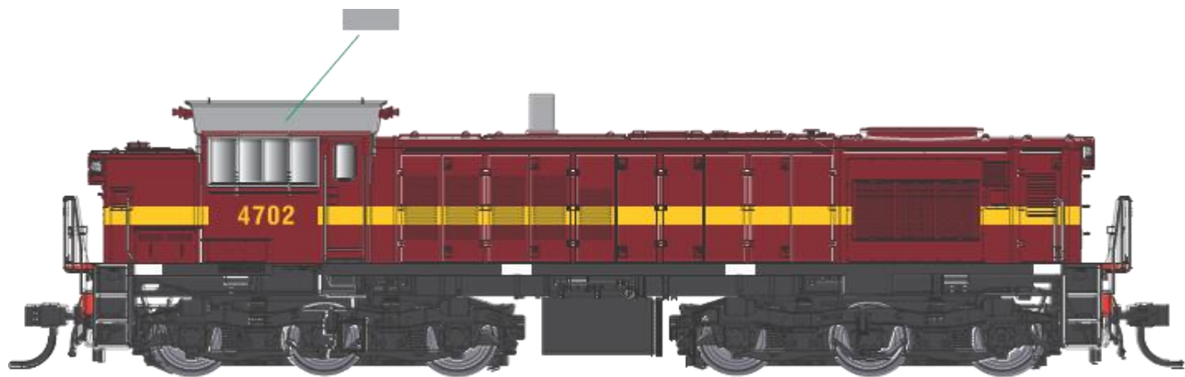
4702 - TUSCAN