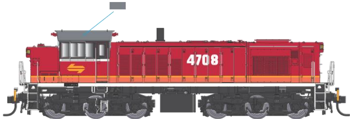
4708 - CANDY