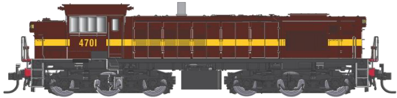
4701 – INDIAN RED